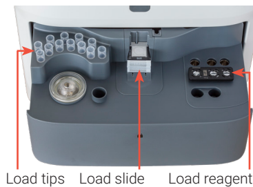
Load tips Load slide Load reagent here here here