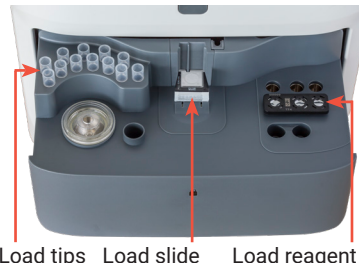
Load tips Load slide Load reagent here here here